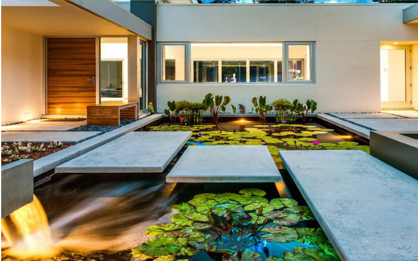
2015 Golden Award Project Lotus on Orange

Our client projects have won over 350 Aurora Awards. In 2015, two of our projects tied for the top Golden Aurora Award.